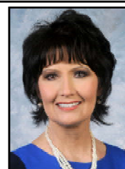
Rep. Kim King