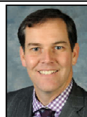
Sen. Max Wise